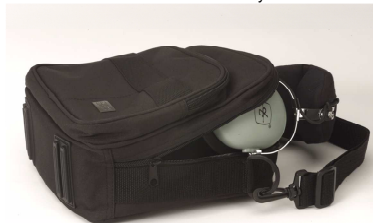
40688G-08 Headset Carry Case