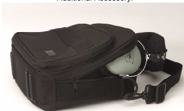
40688G-08 Headset Carry Case