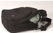
40688G-08 Headset Carry Case